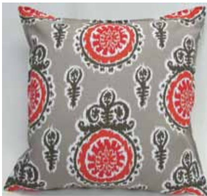
PO2232 22" micro flange edge stitching