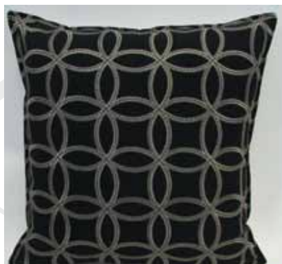
PD2206 22" black with pebble circles