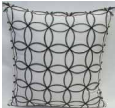
PD2209 18" cream with pebble and black circles