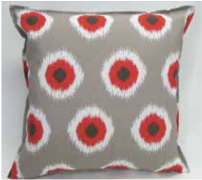
PO2226 22" micro flange stitching