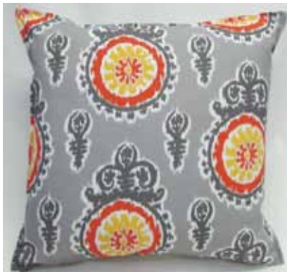
PO2217 22" micro flange edge stitching

Yellow ikat coordinates to flora and yellow coral. Red ikat coordinates to busting dots. Zebra goes with everything.