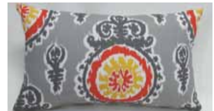
PO2219 17 x 11" micro flange stitched ends