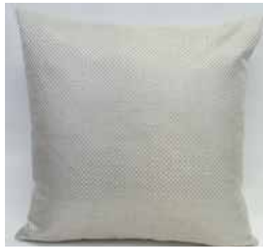
PD2201/18 18" dark cream