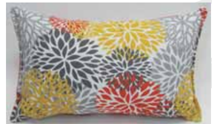
PO2225 17 x 11" micro flange stitched ends