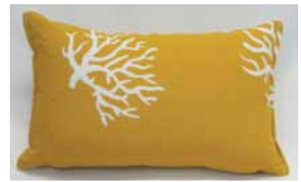
PO2222 17 x 11" micro flange stitched ends