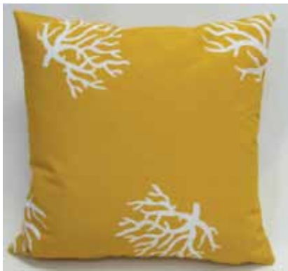
PO2221 22" micro flange stitching