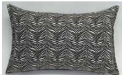
PO2231 17 x 11" micro flange stitched ends