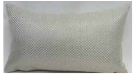
PD2202 19 x 11" dark cream