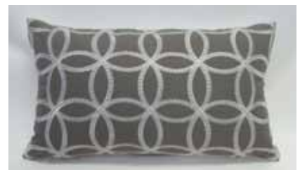
PD2236 19 x 11" pebble with dark cream circles