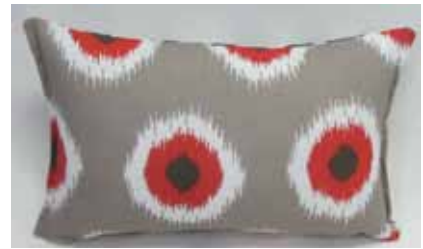
PO2228 17 x 11" micro flange stitched ends