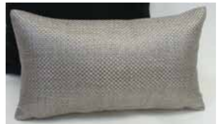
PD2205 19 x 11" pebble