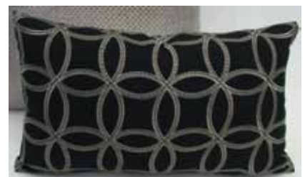
PD2208 19 x 11" black with pebble circles