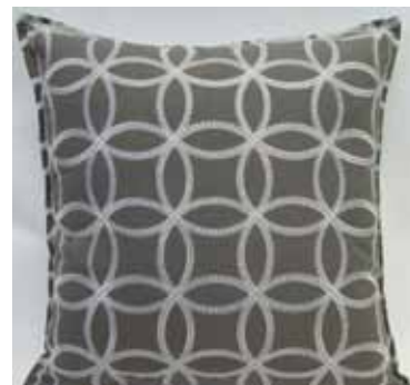
PD2213 18" pebble with dark cream circles