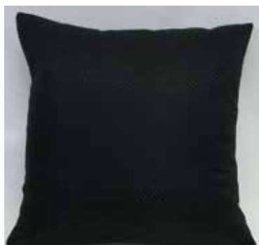
PD2207/18 18" black