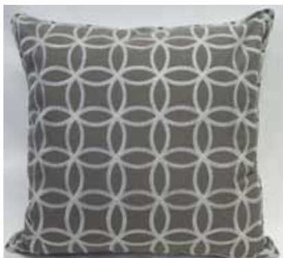
PD2212 22" pebble with dark cream circles