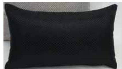
PD2208 19 x 11" black