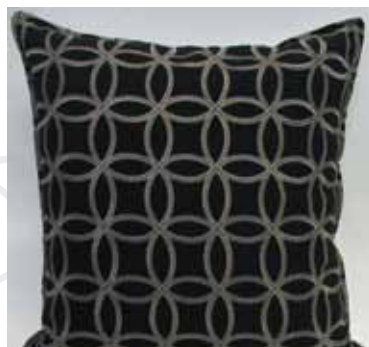
PD2207 18" black with pebble circles