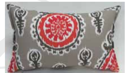
PO2234 17 x 11" micro flange stitched ends