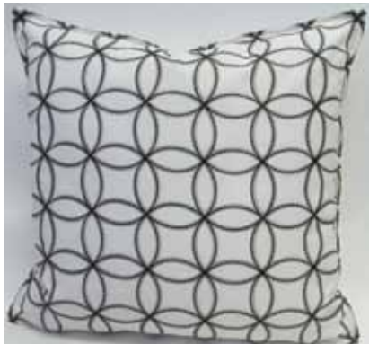
PD2210 22" cream with pebble and black circles