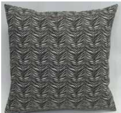
PO2230 22" micro flange stitching