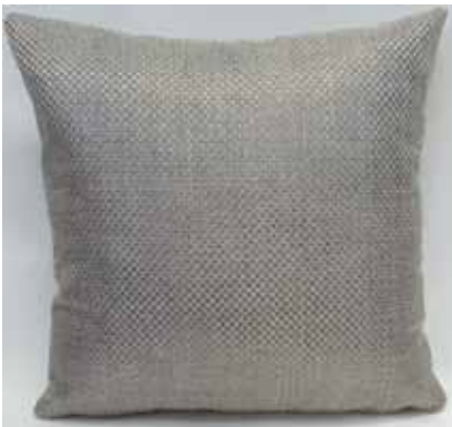
PD2203/22 22" pebble