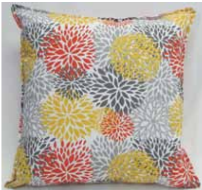
PO2223 22" micro flange stitching